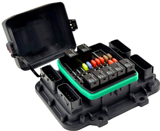
*Fuses and Relays Not Included